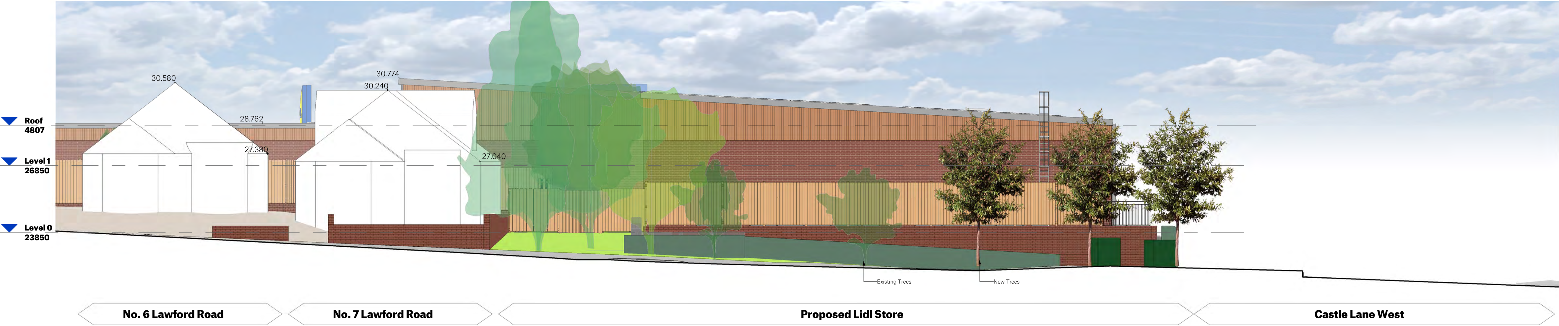
Section B: Proposed Lawford Road Elevation 1:100