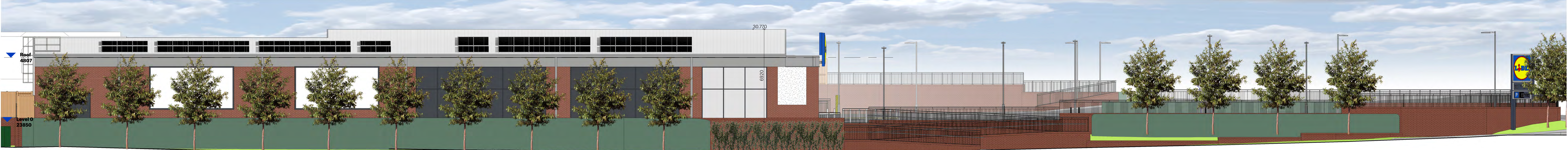
Section A: Proposed Castle Lane West Elevation 1:100